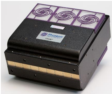
Phoseon FireJet™ FJ200, air-cooled lamp

Hillsboro, Oregon (March 7, 2019) - Phoseon Technology will showcase the latest UV LED curing solutions for coating applications at the upcoming European Coating Show 2019 in Nuremberg, Germany. Visit the Phoseon exhibit, Stand 5-148, to learn how Phoseon LED technology is a perfect fit for coating applications due to the scalable, compact size and ease of integration. The high intensity output is achieved through optimized LED thermal management. Users of Phoseon LED curing systems can process a variety of materials, including heat-sensitive and thin substrates, at maximum production speeds with low-input power.