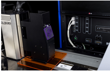
Buskro Curing Station