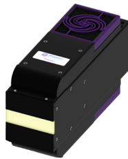
Phoseon FireJet™ FJ200