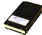
Phoseon FireEdge™ FE200 75x10