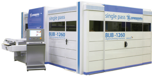
Digital Printing Machine JetMaster 1260