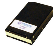
Phoseon FireEdge™ FE200 75x10