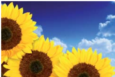
Figure 2: Wide Format Printing

At the high-end are wide format printers creating posters, billboards, or fleet displays with top quality colors as highlighted by the recent announcement by Agfa of the integration of the UV LED based RX FireLine in the :Anapurna 2500 LED product.